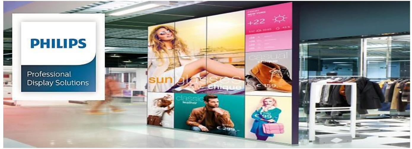
EXTERNAL MARKETING NEWSLETTER